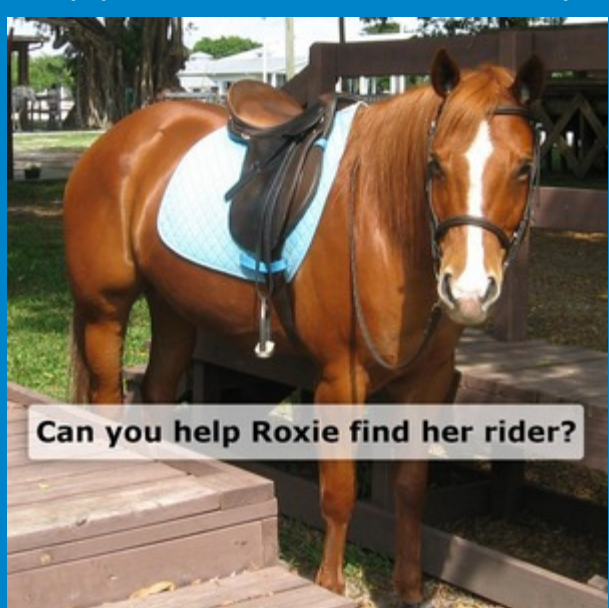
Can you help Roxie find her rider?

We're raffling off a package of ten therapeutic riding lessons. Tickets - $10 each, or three for $20. The drawing is on Sunday, May 3, at the Ride for the Roses horse show! Buy your tickets at the barn today!